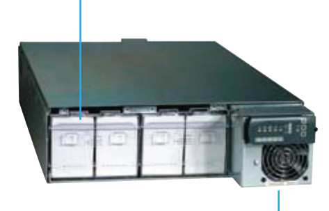
5000/6000 VA rackmount model

Hot-swappable electronic modules—replace electronics modules without shutting down connected equipment (available on 5000 VA to 6000 VA models)